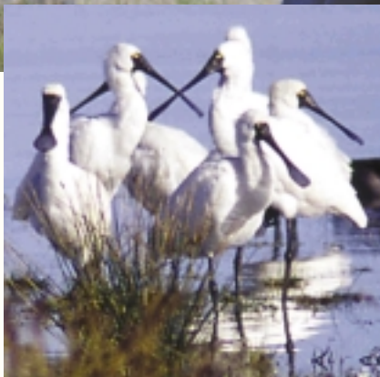
These Royal Spoonbills would become extinct if it wasn't for the estuary. Other threatened birds include fern birds, bitterns and crakes.