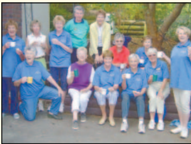
Kapiti Coast Soroptimists take a morning tea-break during a working bee at the Kapiti Women's Refuge.

Part of the money the Soroptimists raise goes to support the child they have 'adopted' through