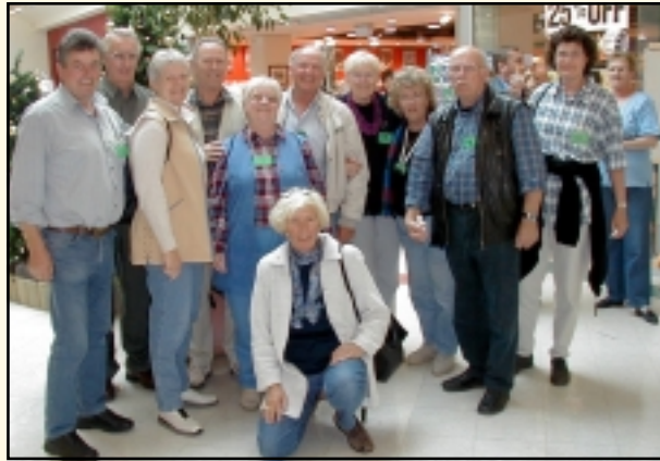
It's a small world. Members of touring Friendship Force clubs from Germany and Australia met up in Coastlands last year as the two groups were enjoying their New Zealand visits.

While the international travel is a great opportunity to see places, it is the forging of friendships around the world that is the ideal behind the clubs. "You get to know your hosts really well before you leave on your trip thanks to the advent of e-mail. By the time you arrive you know all about each other, and because we're not a package tour we visit places our hosts love to show us, often places not on the tourist routes."