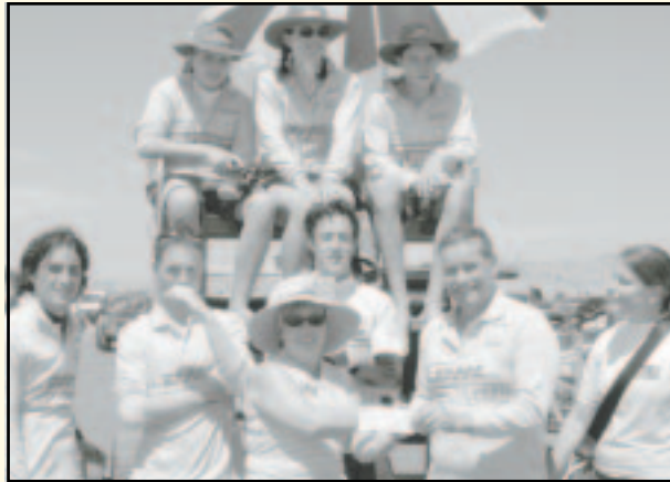
Mixing it with the lifeguards of Waitarere beach, the ladies of the Levin Altrusa Club hand over a cheque to support the lifeguards' work.

The regular monthly programme meeting encouraged networking, sharing information and fellowship, and new women members were made very